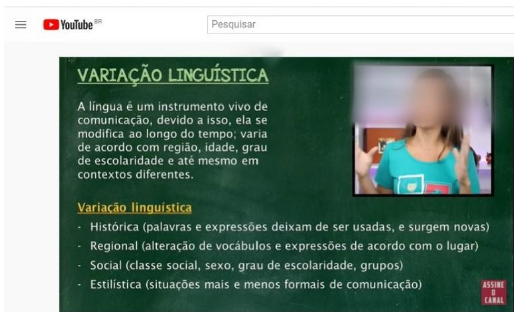
Figure 1: Reproduction of video lesson image on linguistic variation

When referring to the reflection on the language used in the video lesson, we perceive the use of metapragmatic strategies for metalinguistic and metacommunicative purposes, as they seek to explain/describe language and communication through themselves. The understanding of this phenomenon can be reinforced from the image that follows, Figure 1, corresponding to the capture of the screen interface after about 01min32s of the video lesson. In the image, there are two identical titles that mention the content worked in the material and that head the notes available on the screen (aligned to the left, top and bottom, the first in light green, and the second in yellow) “Linguistic variation”. The Figure also allows us to visualize the teacher (in the upper right position) who develops her explanation, using verbal and kinetic oral language (hand movement). Furthermore, in the teaching process, he uses written verbal texts (such as “language is a living instrument of communication”) in white, yellow and light green, inserted in a green background that alludes to the blackboard, a common tool in face-to-face environments. Let's see.