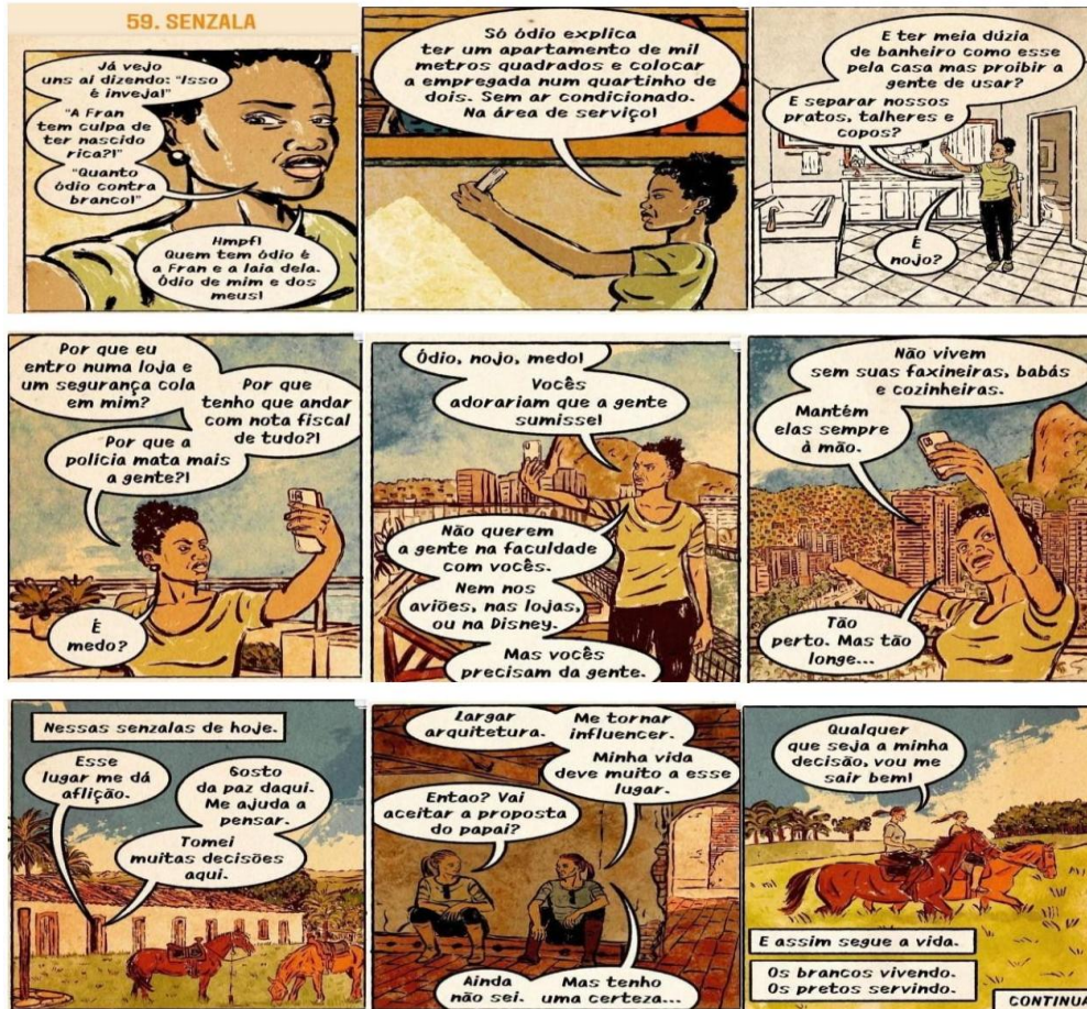
Figura 1: Webcomics Confinada N.59 Senzala 9

Source: Webcomics - illustrations on Instagram @leandro_assis_ilustra, 2020