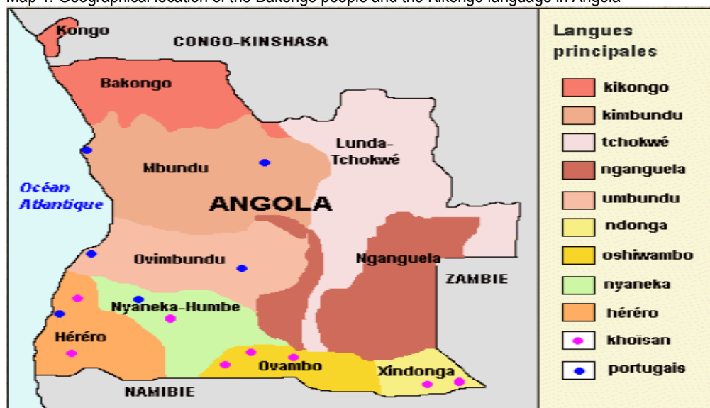
Map 1: Geographical location of the Bakongo people and the Kikongo language in Angola